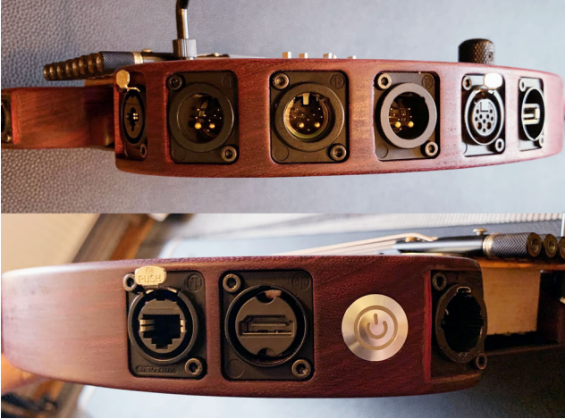
Figure 8: The ports on the sides of the Sophtar’s body.

We decided to include unprocessed outputs to make it possible to play the Sophtar even without the SBC. This way if the computer stops working one can use outboard gear to process the individual signals from the pickups or simply the mono output with an amplifier just like with an electric bass or guitar.