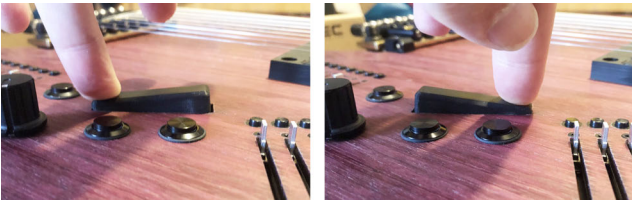
Figure 6: The tilt action of the expression block.

found on the Ondes Martenot as inspiration. It is made of two 3D-printed elements, the button and a box mounted inside the body. The box houses two springs pushing against the button and two distance sensors placed longitudinally. Differently from the touche d'intensité , the expression block of the Sophtar can be tilted left and right (see Figure 6) and the amount of tilting is sensed by calculating the difference between the outputs of the two sensors. The main function of the expression block is to adjust the intensity of the signal sent to the head transducer and therefore modulate the overall amount of feedback. Tilting the block left or right increases the feedback intensity of the low or the high strings respectively. Thus, the expression block allows to subtly and continuously vary the amount of feedback generated by the instrument and at the same time change the spectrum of the feedback within the same instrumental gesture.