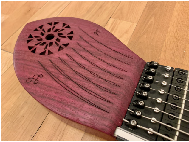
Figure 2: Detail of the head sound box.