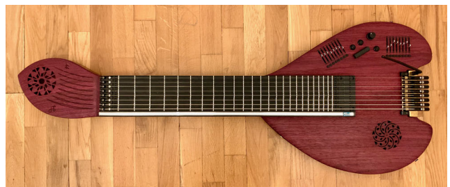
Figure 1: A Sophtar built in 2023-24.

The Sophtar is a new electroacoustic string instrument featuring an embedded system for digital signal processing (DSP), networking, and machine learning. It is meant to lie on a table or horizontal stand to be played, similarly to a keyboard or steel guitar. The instrument is shown in Figure 1. Structurally, it bears resemblance to an electric guitar, albeit with some notable differences. It features two wooden sound boxes: a larger one corresponding to the body (Figure 3) of the instrument, and a second, smaller