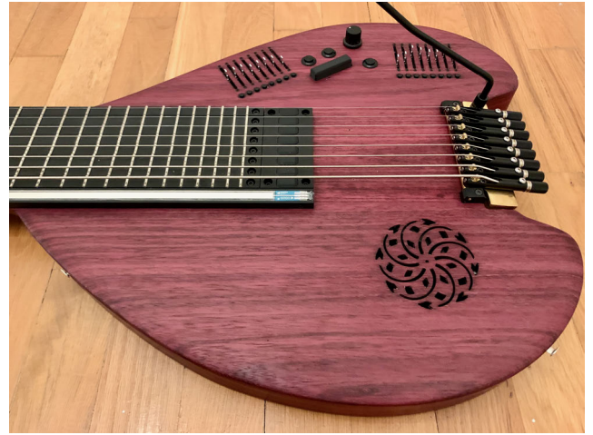
Figure 3: Detail of the body.