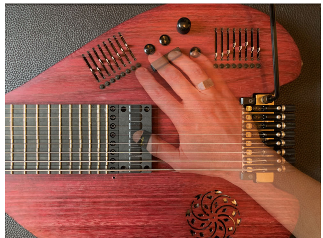
Figure 5: The interface elements on the Sophtar body with a transparent overlay of a hand to better illustrate the ergonomics.

The body of the instrument includes a custom tremolo bridge and various interface elements that we arranged in order for them to be easily reachable with the right hand when plucking the strings using a thumb pick (see Figure 5). All controls are mapped via software, so they could potentially be assigned to control any parameter, but we arranged them with specific functions in mind that I will describe below.